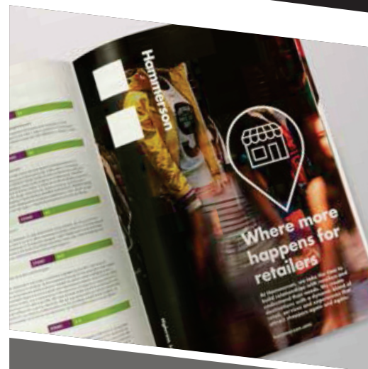
Event Guide Advertising