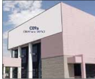
Central Hall Connector To South Hall - C09a