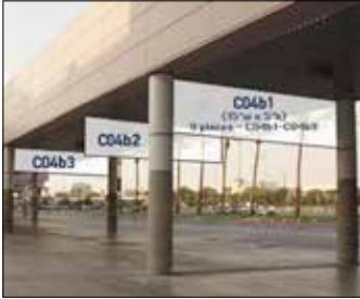
Shuttle Bus Signs C04b1 - C04b9 (9 signs available)