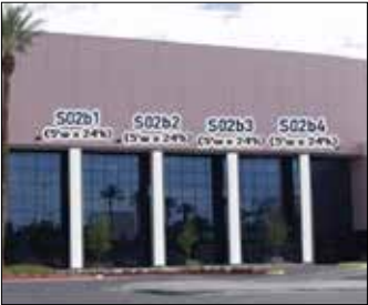
South Hall Entrance Columns - S02b1 - S02b4