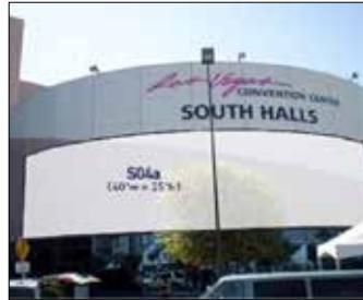
South Hall Banner - S04a