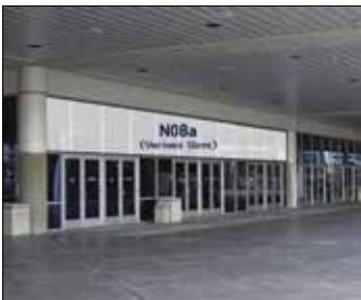
Over Door Window Clings - N08a, (12 windows)