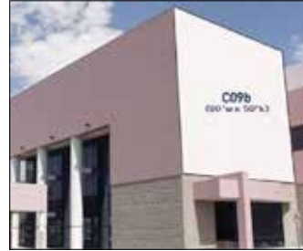
Central Hall Connector To South Hall - C09b