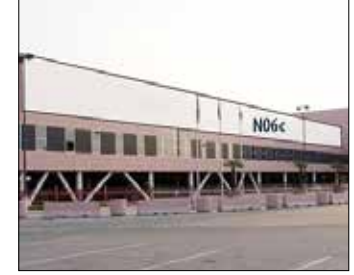
North Hall Entrance Banner - N06c