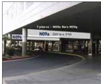
Taxi Pick-Up Signs - N09b - N09g