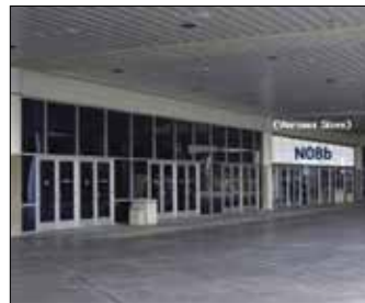
Over Door Window Clings - N08b, (12 windows)