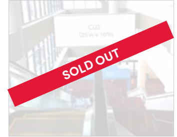
Central Hall Connector To South Hall - C022, (Escalator Banner)