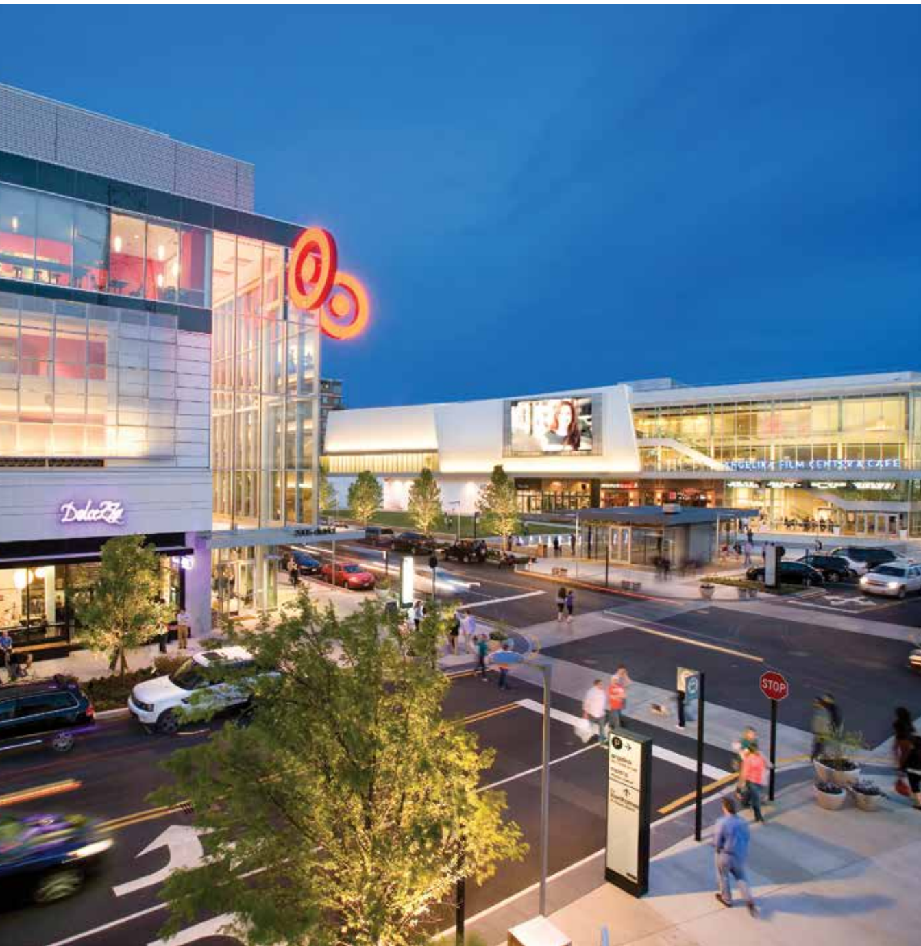
Mosaic – Fairfax, VA | US Design & Development Finalist