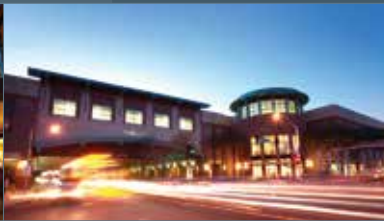
SCOTTSDALE FASHION SQUARE