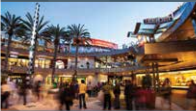
SANTA MONICA PLACE

Winners of the ICSC 2013 United States Design and Development Awards, along with winners from other regional design and development programs offered by ICSC, will automatically be entered into ICSC's Global Design and Development Awards competition, the VIVA (Vision, Innovation, Value, Achievement) Best-of-the-Best Awards, and are eligible to be named "The Shopping Center of the Year" or the "Best Sustainability Project." ICSC's VIVA Best-of-the-Best Awards honor and recognize the most outstanding examples of shopping center design and development, sustainability, marketing, and community service worldwide. The winners of the VIVA Best-of-the-Best Awards are announced during RECon, ICSC's annual convention in Las Vegas, NV.