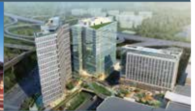
TYSONS CORNER CENTER