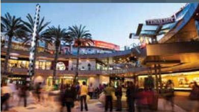
SANTA MONICA PLACE

Winners of the ICSC 2013 United States Design and Development Awards, along with winners from other regional design and development programs offered by ICSC, will automatically be entered into ICSC's Global Design and Development Awards competition, the VIVA (Vision, Innovation, Value, Achievement) Best-of-the-Best Awards, and are eligible to be named "The Shopping Center of the Year" or the "Best Sustainability Project." ICSC's VIVA Best-of-the-Best Awards honor and recognize the most outstanding examples of shopping center design and development, sustainability, marketing, and community service worldwide. The winners of the VIVA Best-of-the-Best Awards are announced during RECon, ICSC's annual convention in Las Vegas, NV.