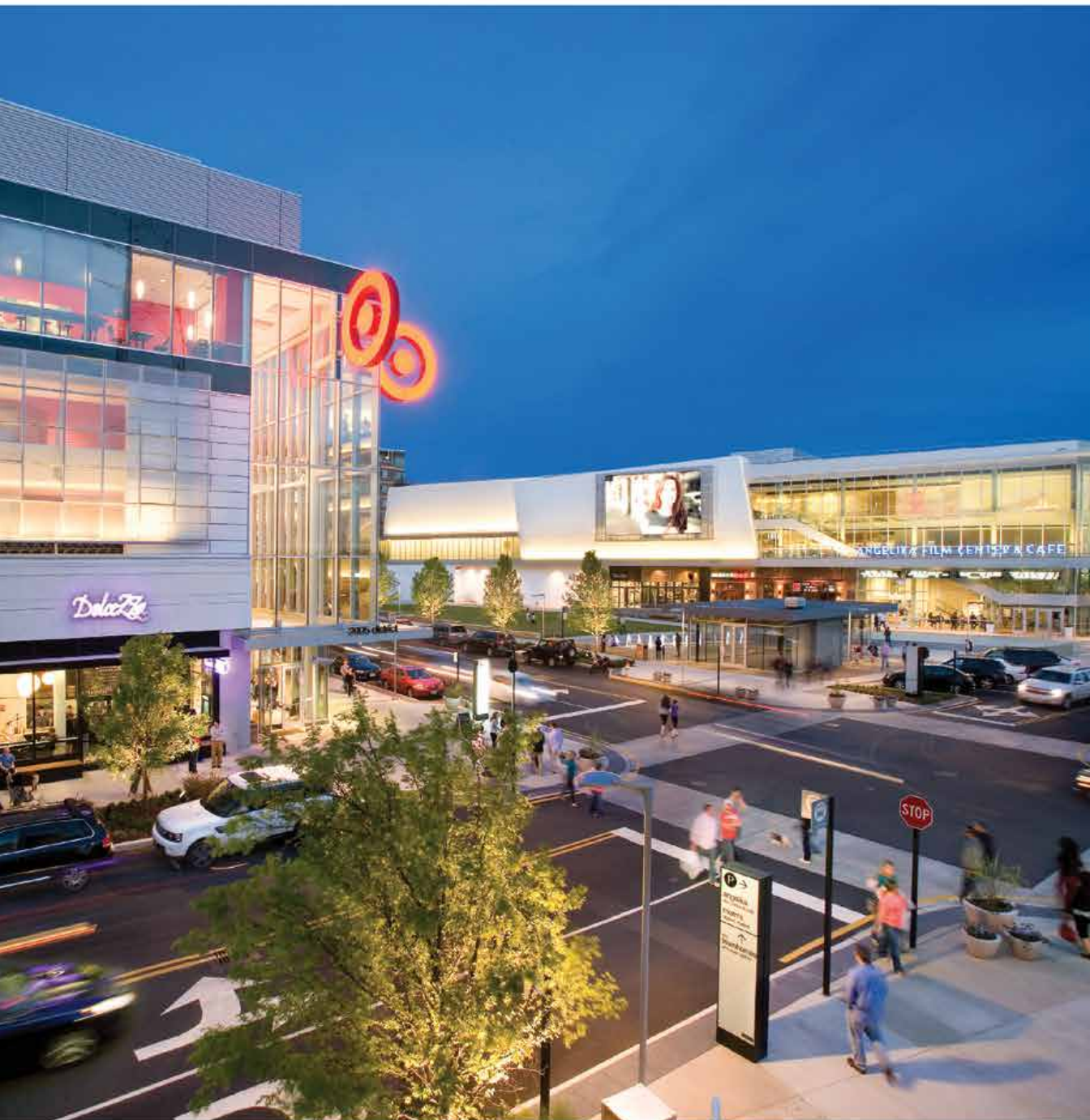
Mosaic – Fairfax, VA | US Design & Development Finalist