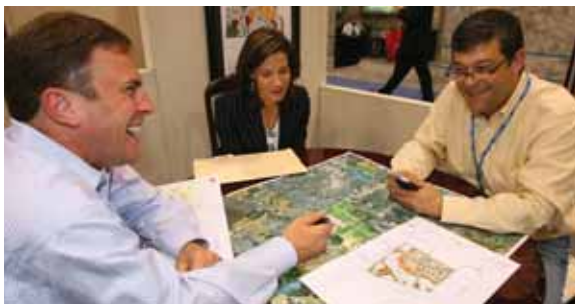
Delegates networking with like-minded professionals.

Beijing Zhongguancun International Development Co., Ltd