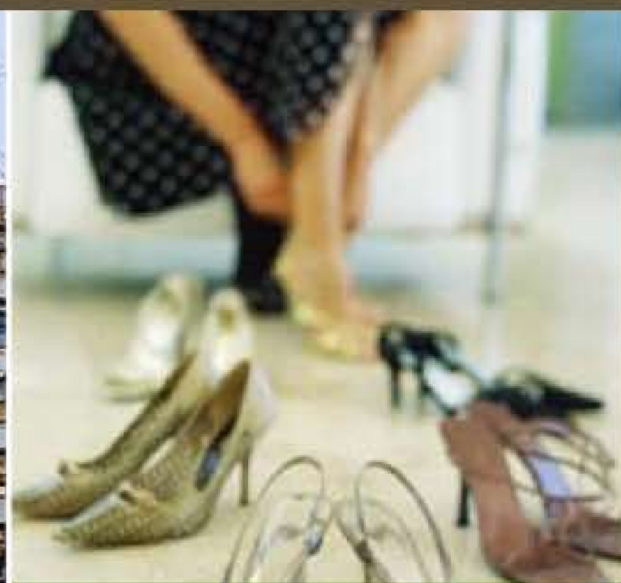
A merchandising shift IN STRATEGY