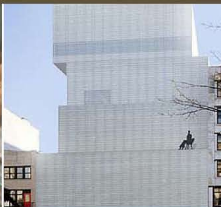
An architectural shift IN STYLE