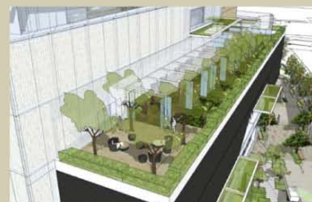
4TH FLOOR TERRACE