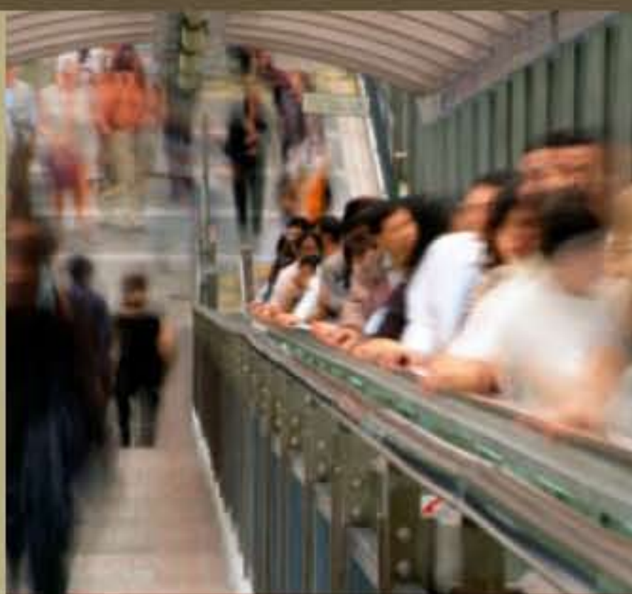
A geographic shift IN LOCATION