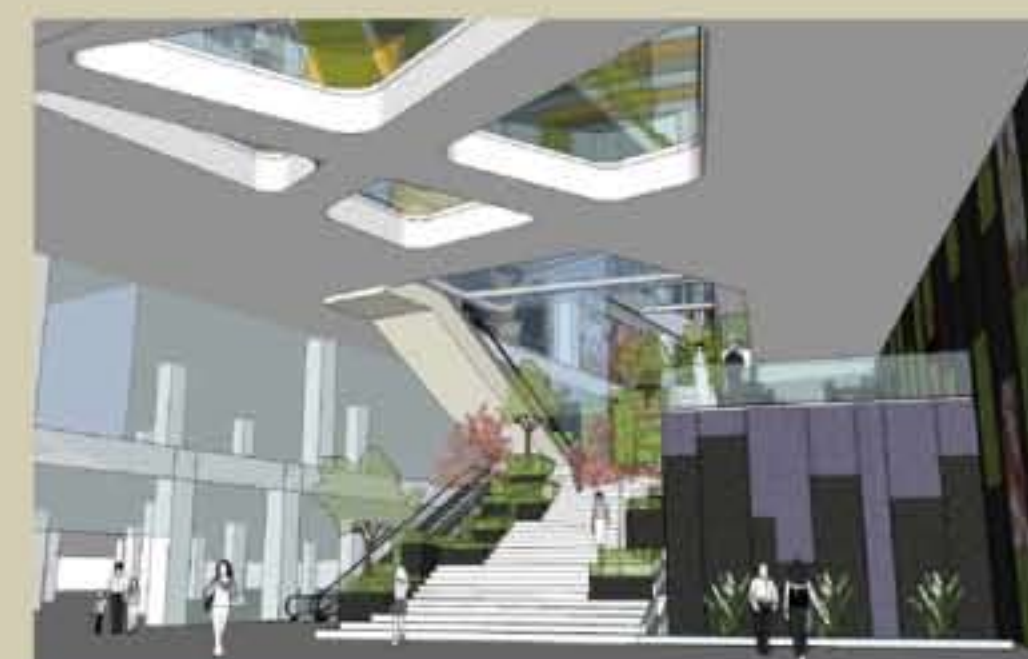
B1 SUNKEN PLAZA