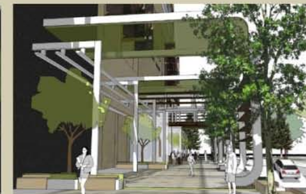
NORTH URBAN PARK