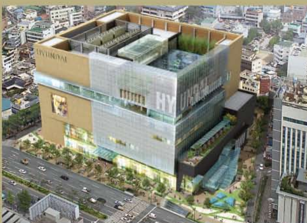
LUXURY MODERN + HIP AND TRENDY