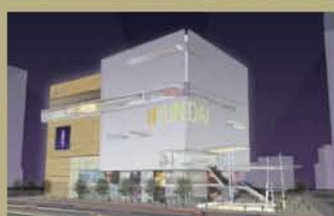
KINETIC LIGHTING EFFECTS AT NIGHT