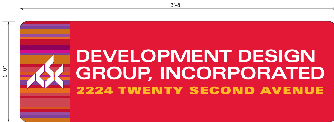
LAYOUT OF THE 2006 EXHIBITOR IDENTIFICATION SIGN

NOTE: Exhibitor Identification Signs and sign frames can only be used with the ICSC exterior wall system. If the 2'-0" x 10'-0" front return is requested to be removed, GES will not be able to install your sign. A maximum of two (2) Exhibitor Identification Signs per exhibit space are allowed.