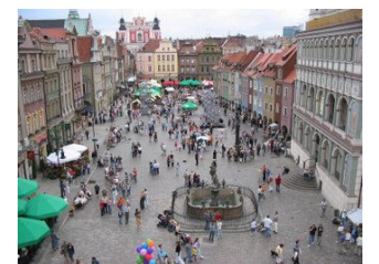
Old Square in the historic district of Poznań