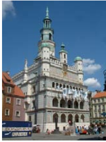
The Town Hall on Old Square