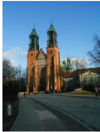
The Cathedral of St. Peter and St. Paul