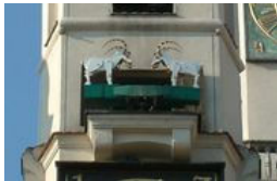
The famous "Koziołki"

Apart from the MTP and annual St. John's Market fair, Poznań offers a wide range of tourist attractions and activities.