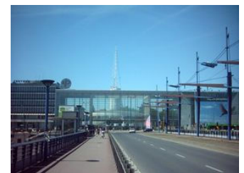
The MTP fair centre

A good business climate is the reason why many foreign investors choose Poznań to base their activities. Among them are a few of world's giants such as Nestle, Wrigley, CPC International, Volkswagen, Exxon / Esso, IKEA or Alcatel. The largest company in Greater Poland, H.Cegielski Engineering Works, which is the leading manufacturer of ship engines and train carriages in Poland, is the heritage of XIX century industrialization.